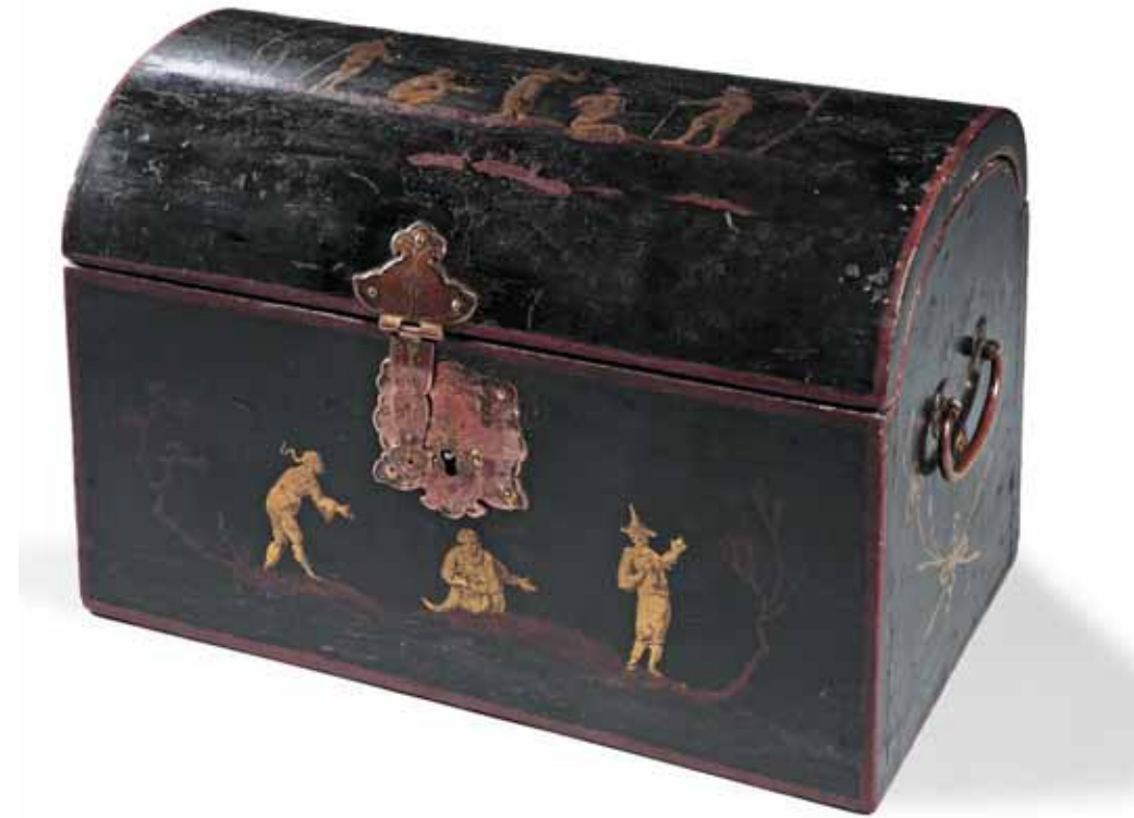
19 Small coffer Japan, Edo period, mid-18th century