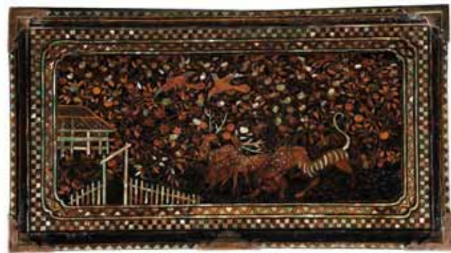
Top of cabinet