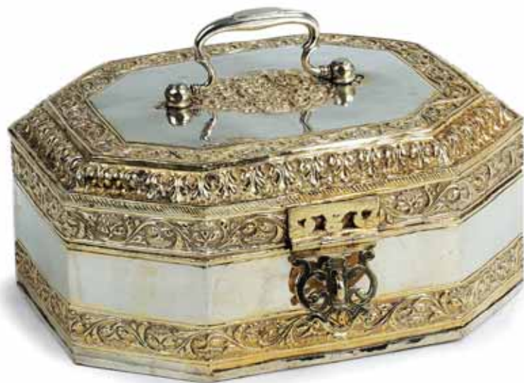
12 Octagonal sirih box Ceylon (Sri Lanka), early 19th century

Silver and silver-gilt, lock and carrying handle, with four containers which originally held ingredients to prepare a sirih quid Height: 9.5cm, length: 22.5cm, width: 18cm, 1807g