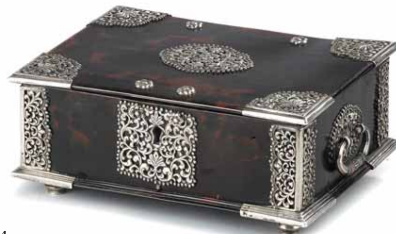
14 Sirih box Ceylon (Sri Lanka), 18th/19th century Tortoiseshell and silver Height: 6.9cm, length: 17cm, width: 12.2cm