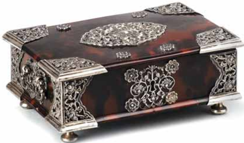
16 Sirih box Ceylon (Sri Lanka), 18th/19th century Tortoiseshell and silver Height: 6.9cm, length: 17cm, width: 12.2cm