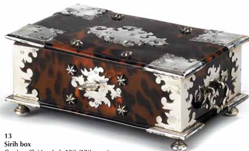
13 Sirih box Ceylon (Sri Lanka), 18th/19th century Tortoiseshell and silver Height: 8cm, length: 19.6cm, width: 14cm