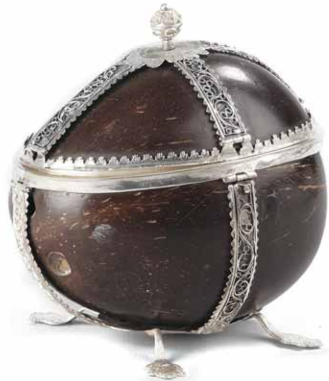
17 Tobacco box Indonesia, probably Java, Batavia, late 18th / early 19th century Coconut with silver and silver filigree mounts, raised on four silver pad feet, apparently unmarked Height: 14cm, length: 14 cm Another coconut tobacco box was illustrated in our catalogue Uit verre streken , June 2009, no. 21 ( deonviljoen.com/index.php?page_id=5 )