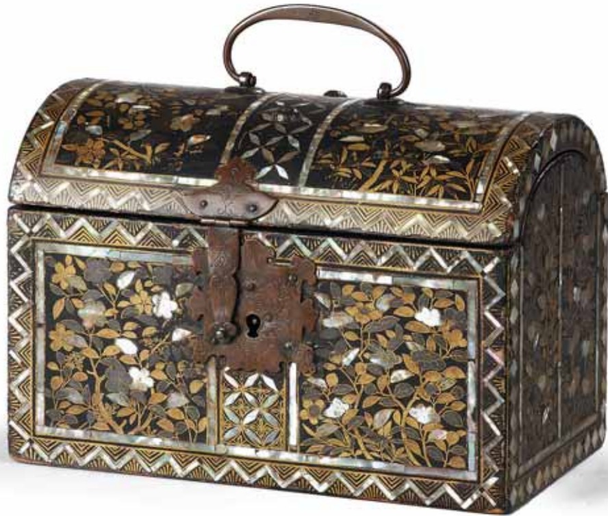
18 Small coffer Japan, Momoyama period, circa 1600

Black lacquer on cedar wood, decorated with gold, silver and mother-of-pearl in Namban style, brass lock plate and carrying handle Height: 15.5cm, length: 20.5cm, width: 13.5cm