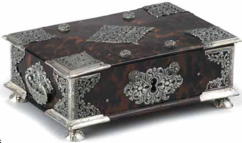
15 Sirih box Ceylon (Sri Lanka), 18th/19th century Tortoiseshell and silver Height: 6.9cm, length: 17cm, width: 12.3cm